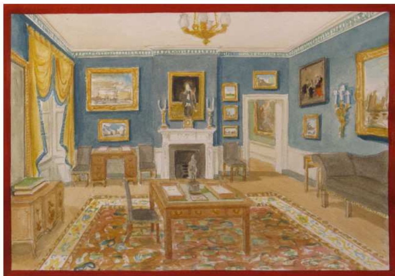
Kenwood House – Design for the redecoration of The Earl of Mansfield's Dressing Room to form Lord Iveagh's Room

The Dressing Room marks the beginning of a different phase in the visitor journey, moving out of the Adams sweep and into the Iveagh Bequest. As a condition of his bequest Lord Iveagh wished his pictures to be seen as if they were in the home of an 18th-century gentleman. This room will be furnished with a desk and chairs in the manner of an 18th-century study. Lord Iveagh's portrait will be displayed over the mantel. The room, a prelude to the Iveagh bequest, will introduce the remarkable figure of Lord Iveagh and hang Iveagh's Dutch Masters, in the manner favoured in the 18th century. Furniture will be available for the comfort of the visitors.